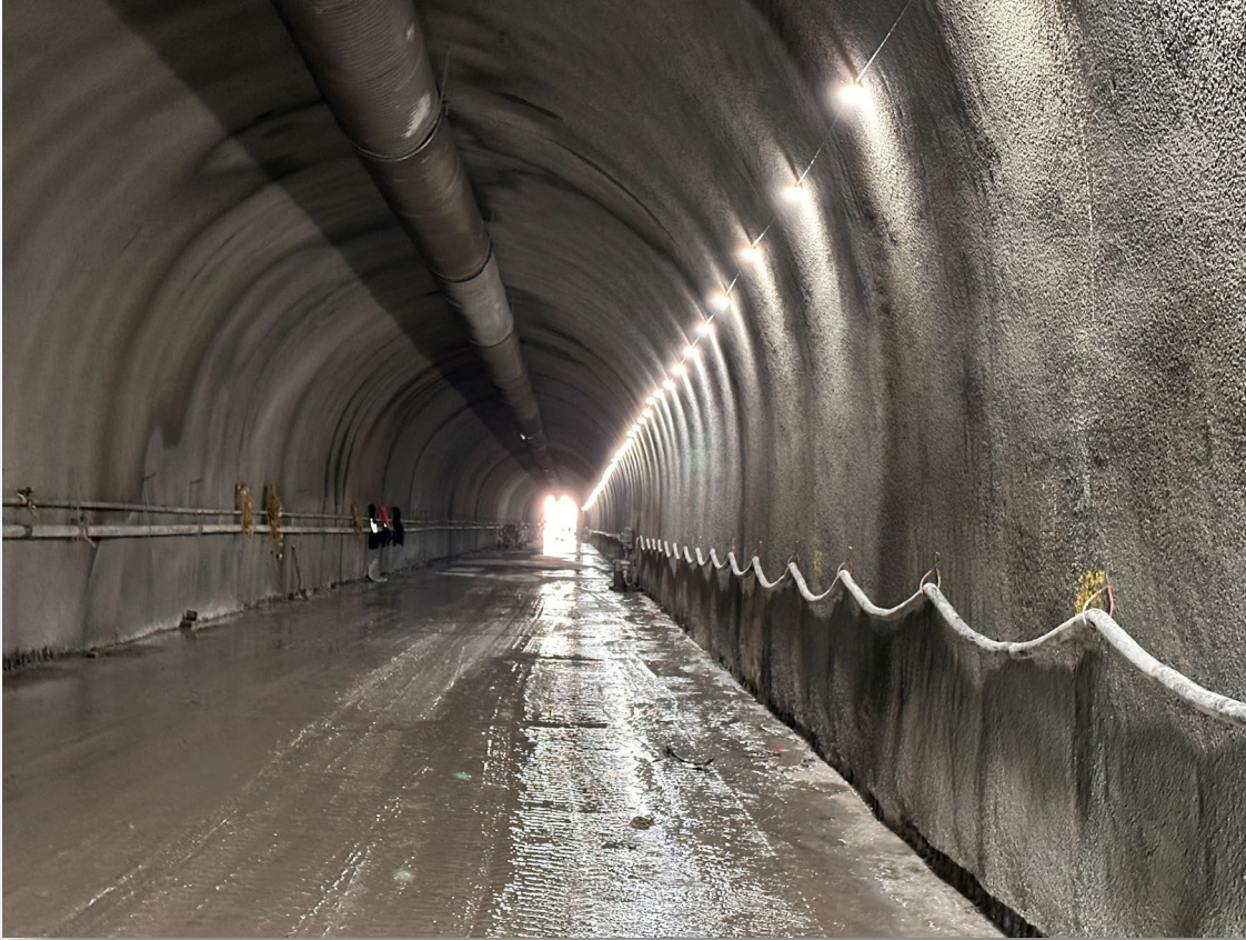
April 2024 Completed tunnel excavation and initial lining