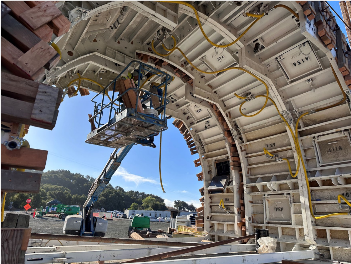
October 2024 Concrete formwork for mockup