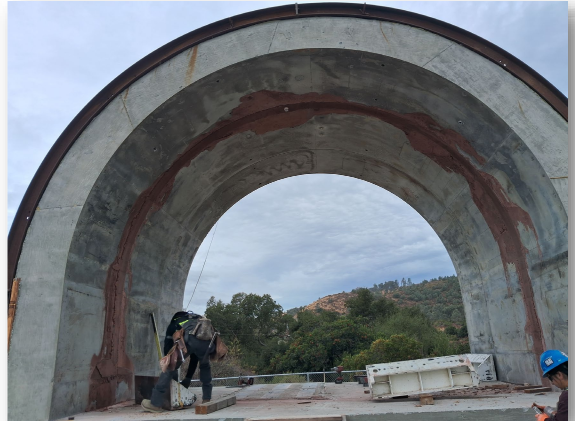
November 2024 Concrete placement completed in the mockup