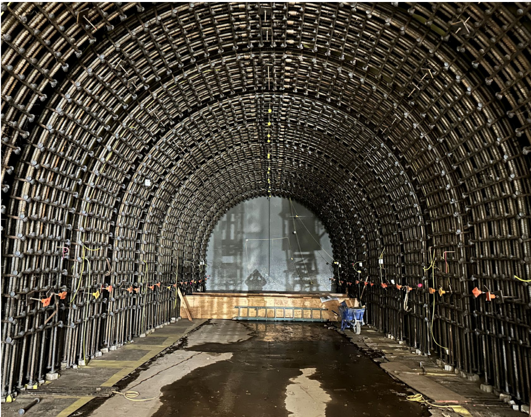
January 2025 Waterproof membrane inside the tunnel