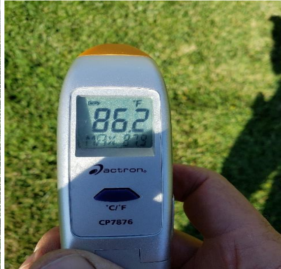
Concrete Morgan Hill 113.6 F Kurapia Morgan Hill – 104.9 F Natural Fescue turf – 86.2 F