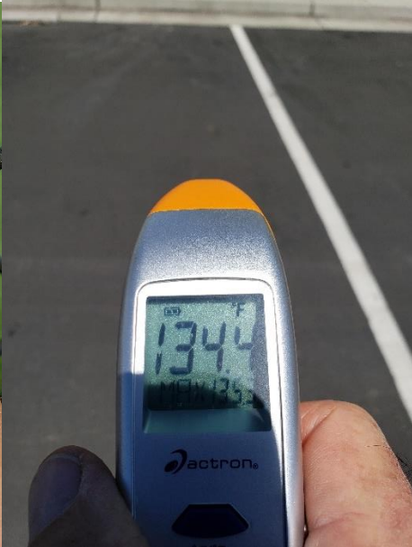
Artificial Turf Morgan Hill – 141.8 F Asphalt Morgan Hill – 134.4 F