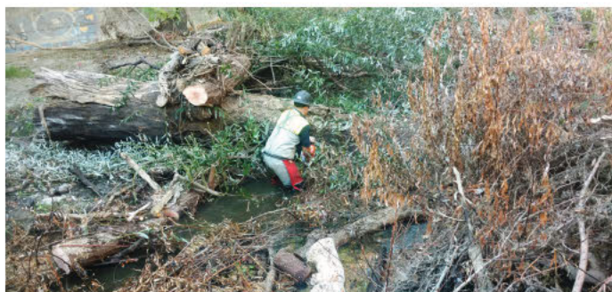
Staff removing fallen trees blocking creek flow.

Maintenance work is prioritized based on several considerations, including available resources. Higher priority is given to capital projects completed with federal partners, levee maintenance, and work to preserve channel capacity.