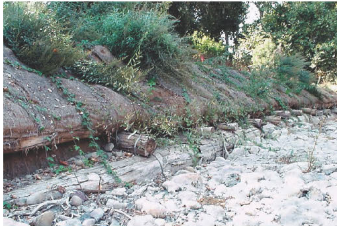
Site of completed erosion repair.