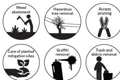
Maintenance activities as a landowner

Valley Water performs work on properties owned in fee title or where otherwise obligated by permit or agreement. These activities include weed abatement, hazardous tree removal, pruning for access, care of planted mitigation sites, fence and erosion repair, and graffiti, trash, and debris removal.