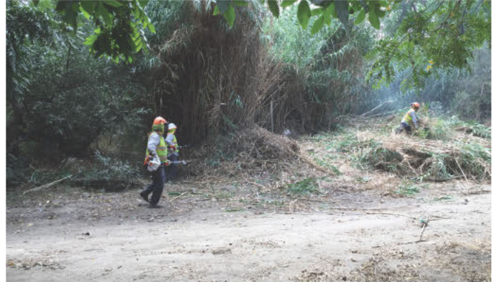
Crews removing giant reed ( arundo donax ), an invasive plant, from creek.

Stream stewardship activities that remove invasive plants along streams are conducted by Valley Water staff. This work may occur on Valley Water property and easements with permission from the property owner. Because it is important to eradicate invasive plants along a creek on a watershed and watershed wide basis and the Safe Clean Water Program provides funding for this activity, staff may also seek permission to perform this work on private property.