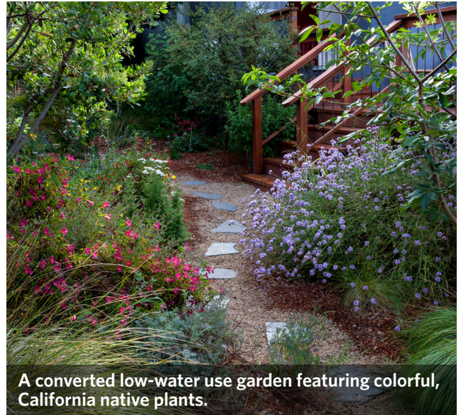
A converted low-water use garden featuring colorful, California native plants.

Any commercial, industrial, institutional properties or multi-family residential properties can receive a rebate of at least $1 per sq. ft. for converting a qualifying lawn to a minimum of 3 inches of mulch.