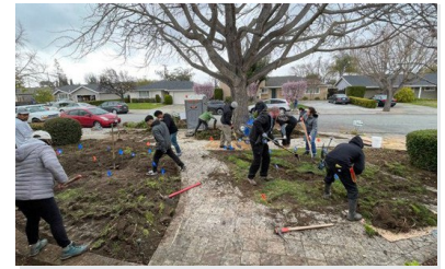
Permaculture pilot project students learning hands-on lawn conversion.