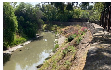
Location of proposed in-channel widening along San Francisquito Creek.

The SFCJPA continues to pursue partnerships with federal, state, and local agencies for additional construction funding for the Reach 2 Project.