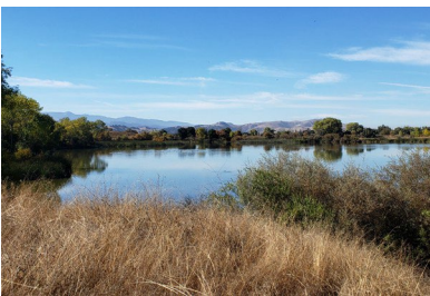
Ogier Ponds, looking north.